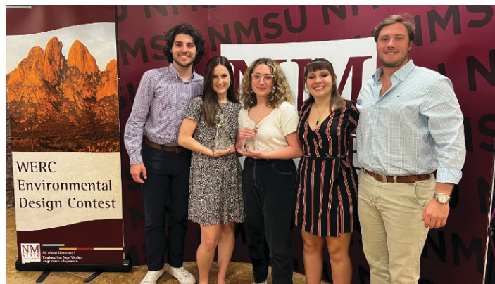
LSU Team 19 wins best bench-scale demonstration in Task 6b.

The teams would like to thank the contest sponsors, New Mexico Space Grant Consortium, El Paso Electric Company, Las Cruces Utilities, Freeport-McMoran, Arrowhead Center, EPA Office of Research, CDM Smith, Arrowhead Center, and X2NSat. The teams would also like to thank the New Mexico State University staff who have put on the competition for 32 years. LSU Civil and Environmental Engineering would like to thank local sponsors who have helped bring everyone to the competition over the past decade, regardless of the ability to pay. The 10 trophies from the 2022 teams double the most ever won at the competition. Congratulations to all of the environmental engineering seniors who competed in 2022, and best of luck in your future endeavors.